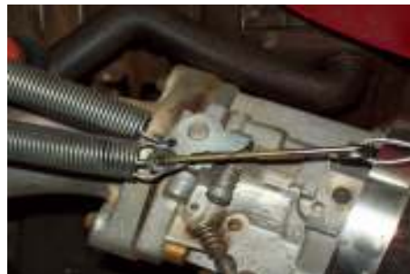
Photo 2: Notice that the springs are attached to the same bracket this is incorrect! They must be mounted on two separate mounting brackets. This way if for any reason one breaks you will still have one spring attached.

Photo 1: This is the correct way to attach the throttle return springs on the carburetor Notice they are mounted on two different Locations and not together;